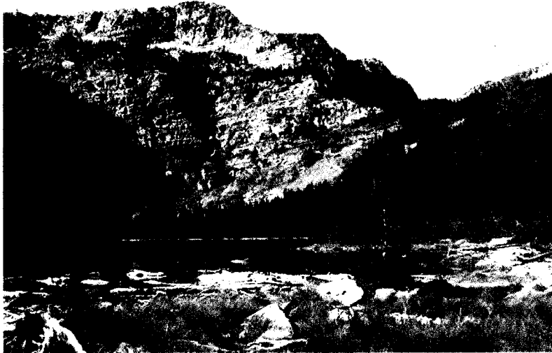
Geiger Lake near Libby, MT